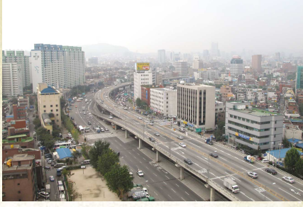
2 Today's Cheonggye-cheon Area(The stream was covered and used for roadways)