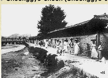
1 The Cheonggye-cheon in the 1890s